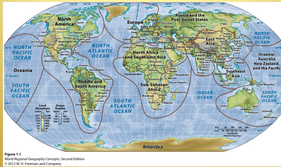
Figure 1.1 World Regional Geography Concept, Second Edition