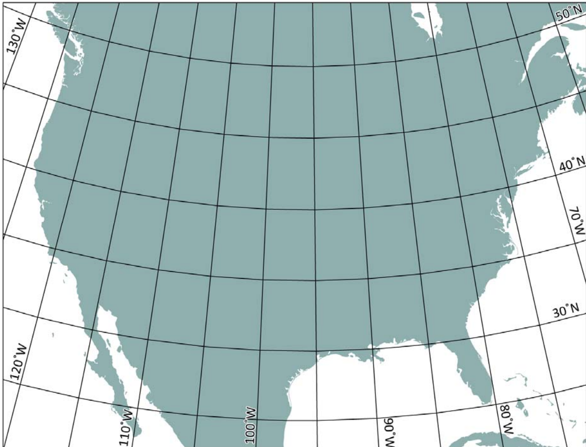
Map 1. The United States with graticule.